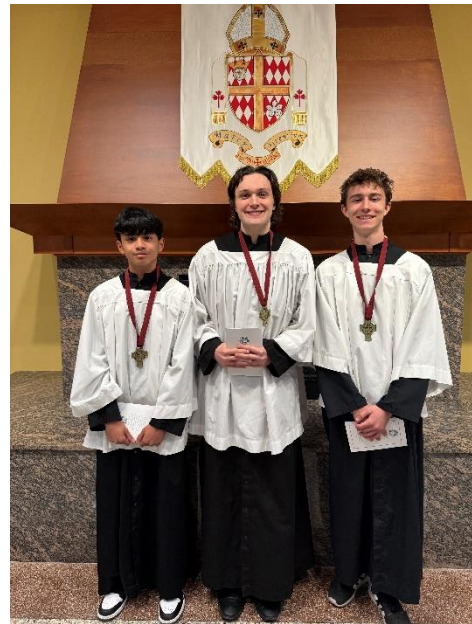
May 28, 2025 - Christ The King Cathedral